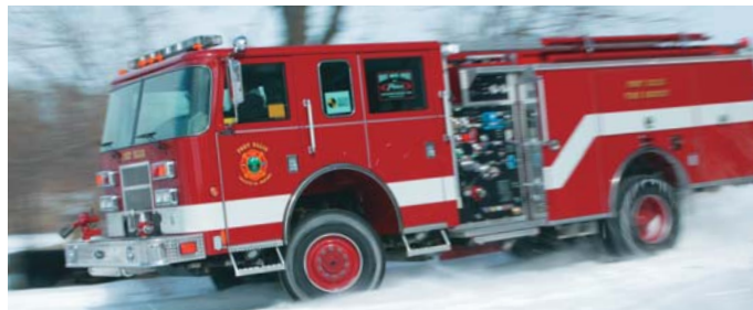
Master Low-Traction Situations with 4x4 Saber's optional 4-wheel-drive system is built to get you quickly across slippery surfaces and over rough terrain.