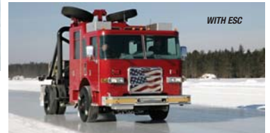
Electronic Stability Control (ESC) Optional automatic safety management braking system, enhances the directional and roll stability of fire apparatus during evasive maneuvers.