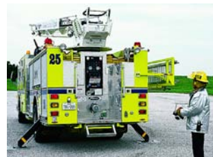
The optional electronic, wireless control system is easily hand held, allowing the operator to stand up to 500 feet (152 m) from the apparatus for optimum visibility of boom operations.