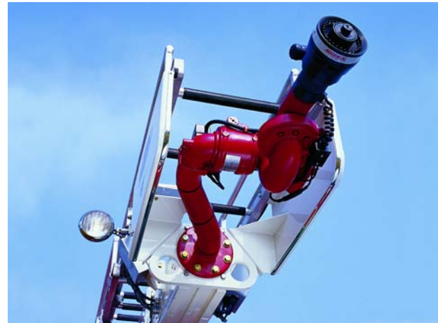
The boom can be positioned on windowsills and parapets thanks to the nozzle's recessed, protected location.