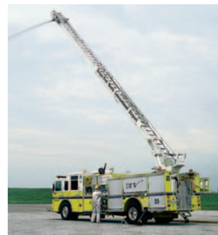
The waterway, extension cylinder and electrical wiring are all located inside the boom.