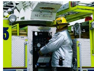
Simplified aerial device controls feature three levers and hydraulic manual overrides.