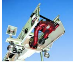
Recessed in underside of tip boom for storage and nozzle protection.