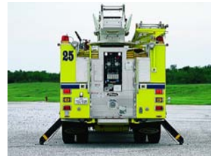
The Sky-Boom sets up quickly with a single set of A-Style stabilizers.